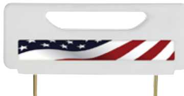
Stars & Stripes