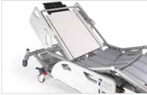
Optional X-ray backrest